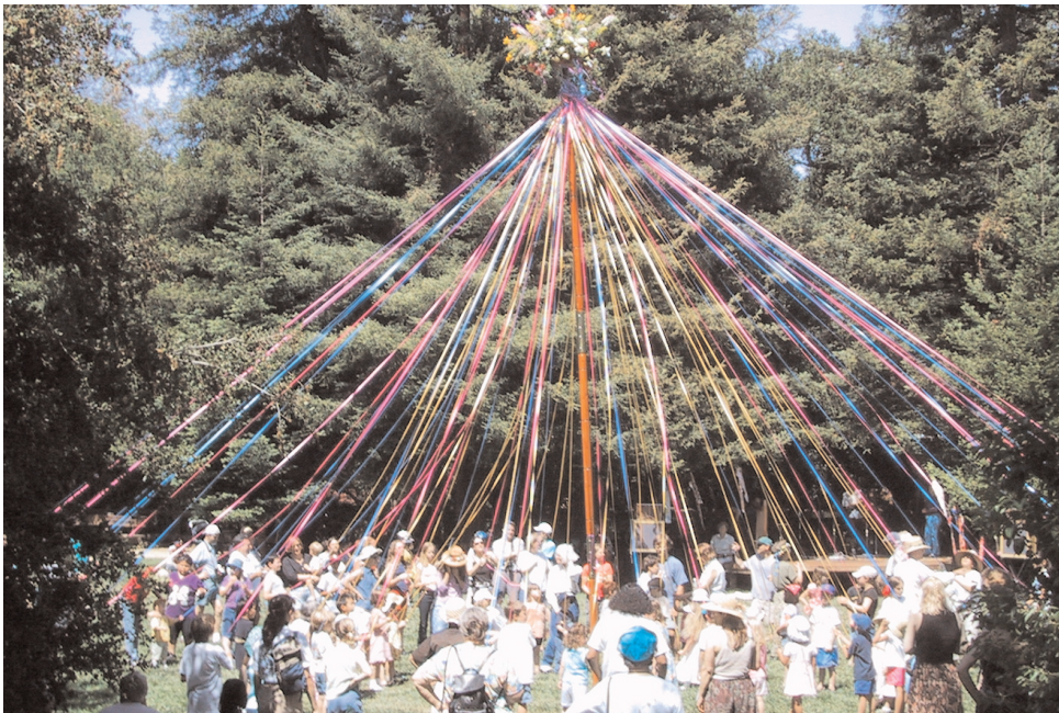
May Pole dancers at the May Fete in Bol Park (see story on page 6).

Lots of street work will be going on over the next several months. Residents on the street affected, have already been given notice and will continue to receive notification about work schedules. This work will disrupt parking and cause the usual dust but public works will be trying to accommodate issues that come up and they have assured us that all the work will be completed before school begins in September. I hope everyone has a great summer!