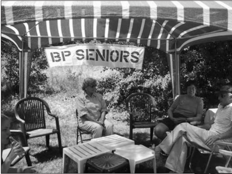
The Seniors Booth at the May Fete had plenty of shade!