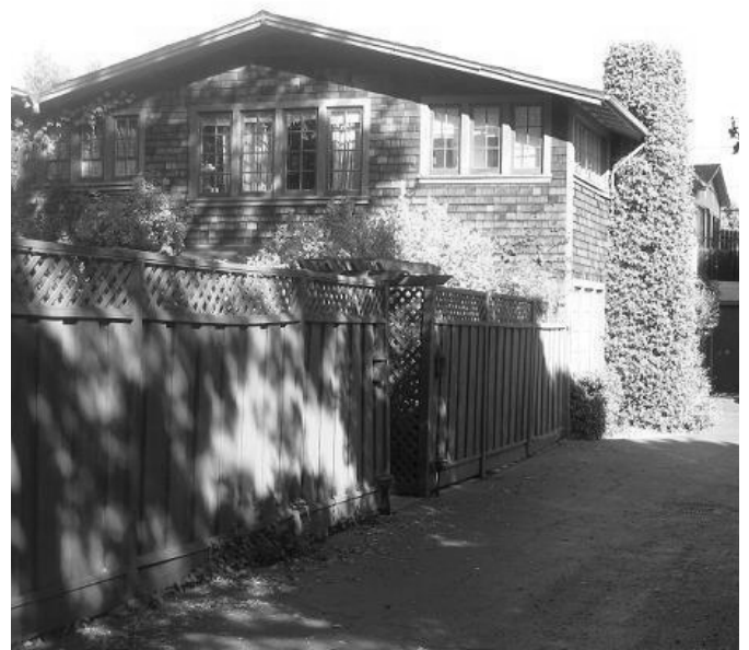
Photo #2: The old Verna Jean School Building at 3895 La Selva Drive in November, 2009.

Today, the house at 3895 La Selva Drive is a large, two-story brown shingle-sided building with multi-paned windows and two shallow gables constituting the roofline facing the street. A large oak tree blocks the view from across the street and leans partly over the driveway. A high, green-painted wood fence encloses the front yard except for a narrow parking strip and blocks any view of the first story (see the photograph accompanying this story). The building has been a private residence for the past several decades.