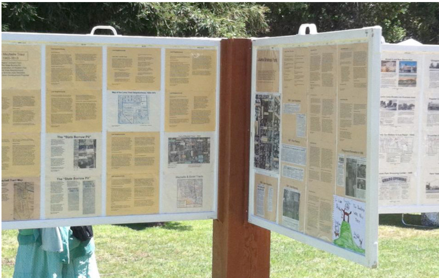
Barron Park history exhibit.