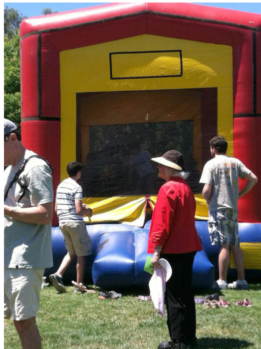
Jumping ball structure.