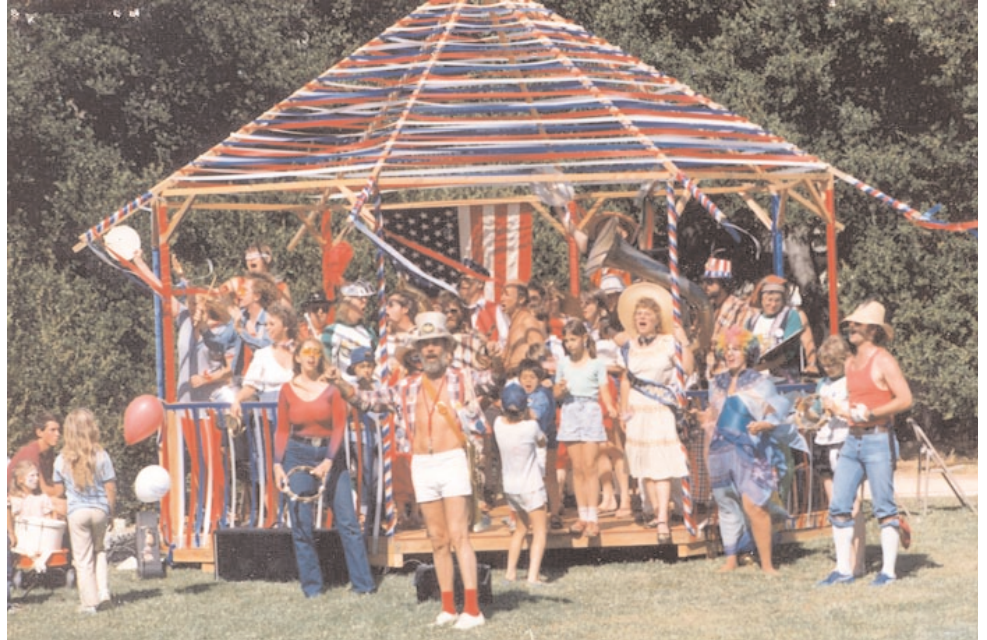
The Drum Major leads us in patriotic song