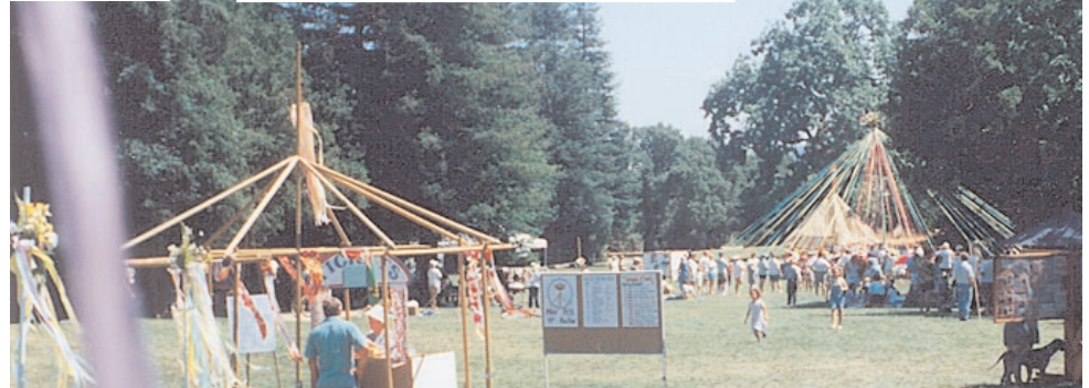
Below: Overall view of May Fete 1984