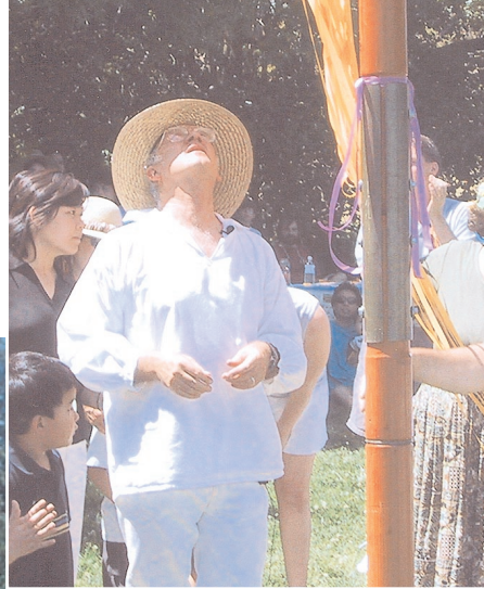
Left: Maypole dance 2001